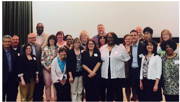
DSL students with ASL Board Members

One recent outcome of the collaboratory was the project with Alpha Sigma Lambda (ASL) Honor Society to create a strategic plan.